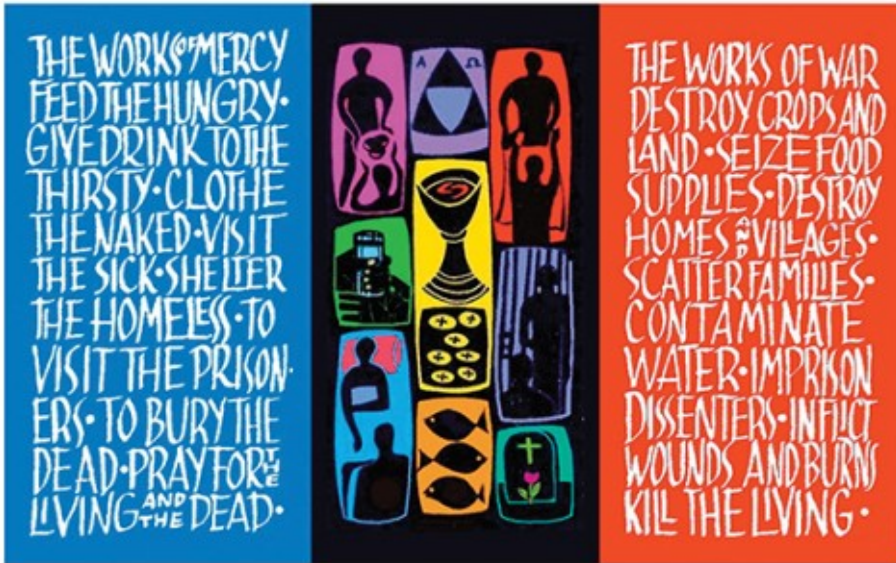
Artist: Rita Corbin